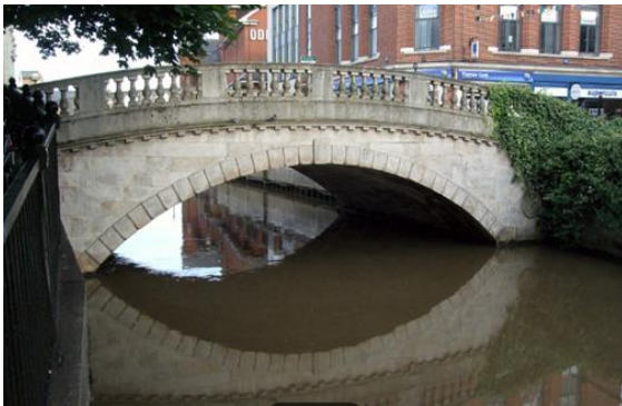
The Stone Bridge

The tour started at the Stone Bridge built in 1784 over the River Can. Nearby is a Blue Plaque commemorating Thomas Watts, a heretic who was burnt at the stake in 1555.