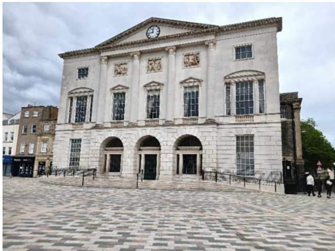
The Shire Hall

Our tour finished near the Chelmsford Station and outside the Brewhouse Kitchen which was formerly a Quaker Meeting House from 1823 to the mid 1950's. This was also known as the Anne Knight Building; her Blue Plaque appears on the front of the building.