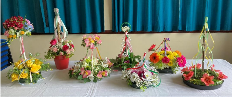
Flower arrangements around a Maypole