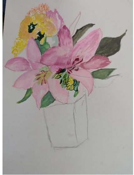
Flowers, watercolour work in progress Maureen Taylor