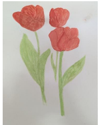
Watercolour Sylvie Harden