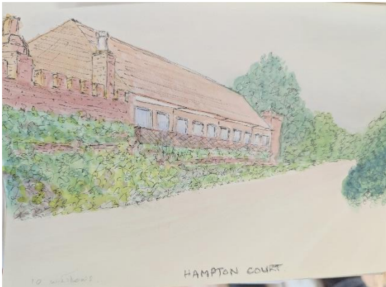
Perspective, Hampton Court Graham King. Watercolour and pen